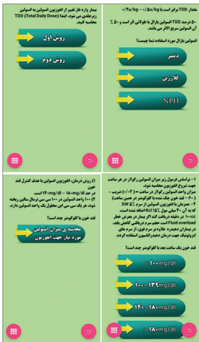
Figure 2: Some screenshots of different parts of the app

described the application to be user-friendly (high and very high). Moreover, 69.3% reported the application to be very necessary for health providers, especially physicians [Figure 2]. More than 77% of physicians described that the design of application is appropriate, 88% mentioned that the texts are understandable and legible, and 80.4% described the different steps of application are well sequenced. Based on the appraisal, the application has helped physicians in course of treatment process. Using the software was easy for the vast majority of physicians. More information is provided in the Table 1.